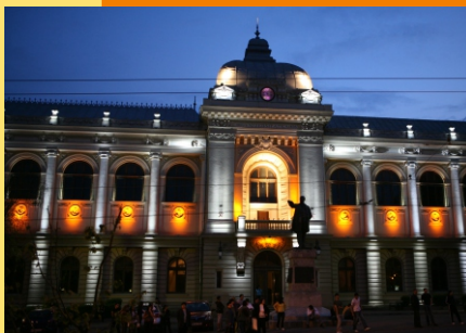
"Gheorghe Asachi" Technical University of Iaşi

ORGANIZED BY: "Gheorghe Asachi" Technical University of Iaşi