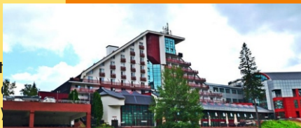
Hotel Piatra Mare, Poiana Braşov www.piatramare.ro

Poiana Brasov is the most famous mountain resort in Romania, located at 12 km (8 miles) SW of Brasov, at 1030 m altitude. With these coordinates Poiana Brasov is the ideal full season resort for your holiday. With temperatures between +10C and +28C, summer in Poiana Brasov is for sure the best time to enjoy the fresh air on mountain tracks around the resort, mountainbiking, walking, or horse riding. Other sportive amenities include enjoy 3 outdoor tennis courts, the Olympic Track or the football field to keep you in shape. In about 45 minutes you can reach Brasov's Old Center, Schei, walking through the woods on Drumul Vechi road. With almost 60 km of ski domain and 12 slopes of various difficulty, the resort of Poiana Brasov is the main touristic attraction for ski in Romania. The ski area has 7 ski-lifts, 2 cable-cars and 1 gondola, night ski and snow cannons on Bradul slope.