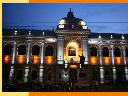
"Gheorghe Asachi" Technical University of Iasi