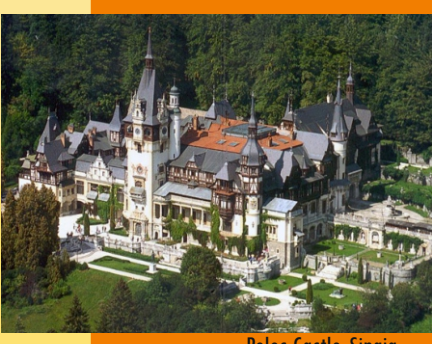
lles Castle, Sinal

Faculty of Textiles, Leather and Industrial Management, 29, D.Mangeron Blvd., code:700050, laşi, Romania Tel./fax: +4 0232 230491