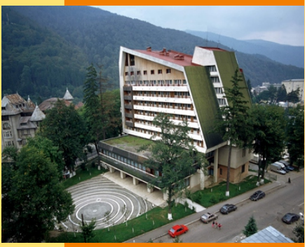
Hotel International, Sinaia

http://www.welcometoromania.ro/Sinaia_Lista_Objective_e.htm)